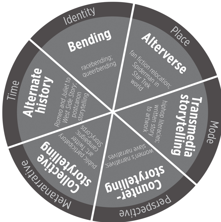
FIGURE 1 Forms of restorying