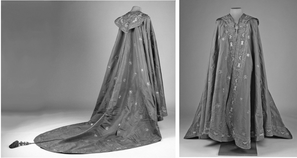
Image 4. Back and front view of mantle, 1804–1807, Spain.